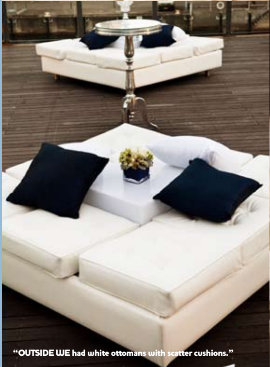
"OUTSIDE WE had white ottomans with scatter cushions."

The Menu ENTRÉE Grilled Crystal Bay prawns with baby-leaf salad OR Lamb cutlet wrapped in mascarpone and pancetta on Belgium endive, tarragon and Armagnac sauce MAIN Porcini-dusted beef fillet, ratatouille, smashed potatoes, gorgonzola cream and onion crisps OR Five-spice chicken breast, onion compote, bok choy with garlic purée and Szechuan pepper jus DESSERT Chocolate-mud fondant with Cognac mascarpone OR Warm apple tart with coconut sorbet