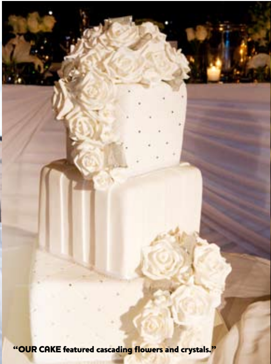
"OUR CAKE featured cascading flowers and crystals."