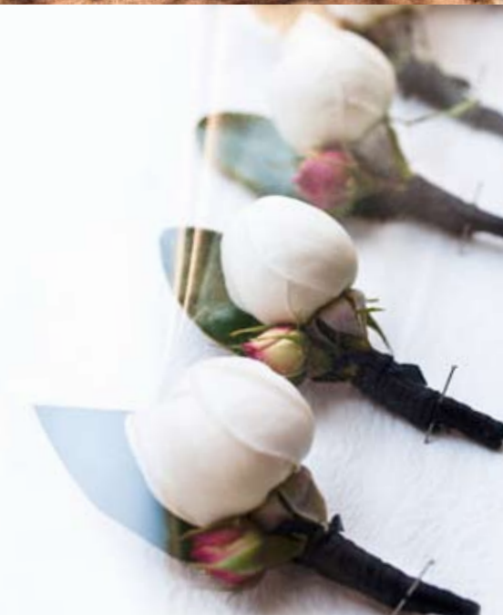
"THE BUTTONHOLES were David Austin roses."