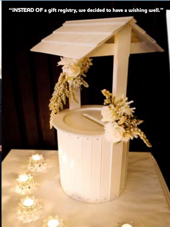
"INSTEAD OF a gift registry, we decided to have a wishing well."