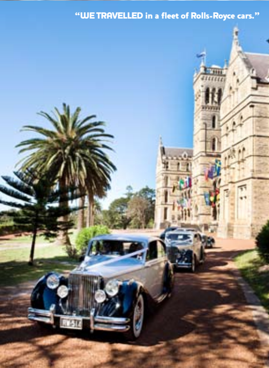
"WE TRAVELLED in a fleet of Rolls-Royce cars."

"Framed wedding photos of our parents and grandparents were on display, surrounded by candles"