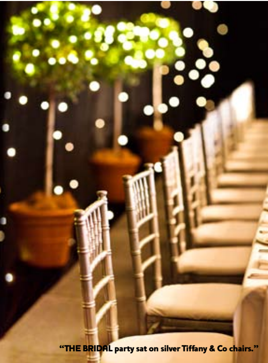
"THE BRIDAL party sat on silver Tiffany & Co chairs."