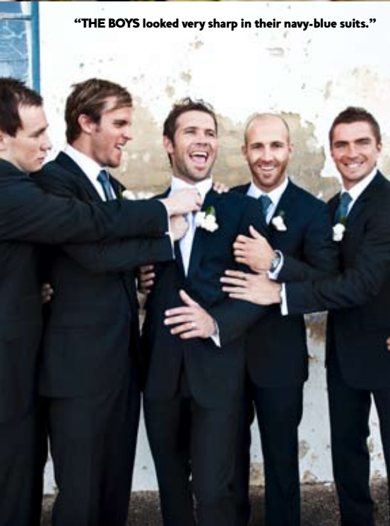
"THE BOYS looked very sharp in their navy-blue suits."