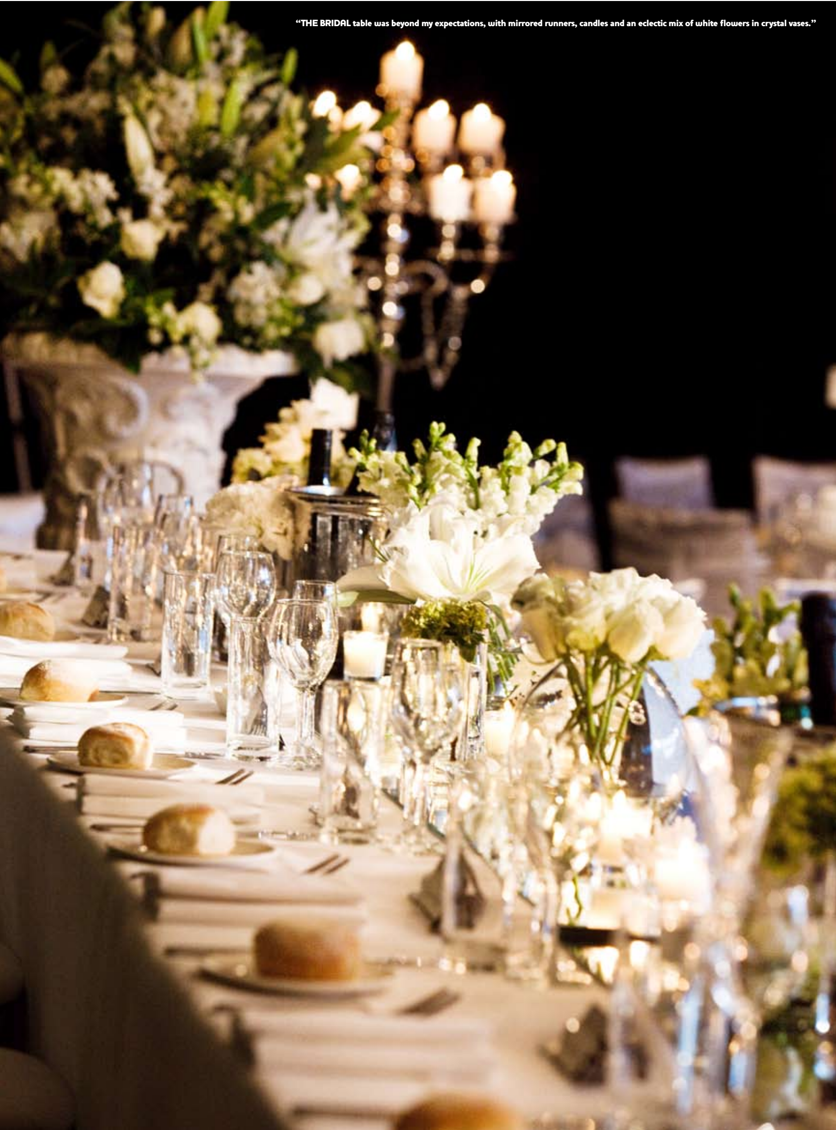
"THE BRIDAL table was beyond my expectations, with mirrored runners, candles and an eclectic mix of white flowers in crystal vases."